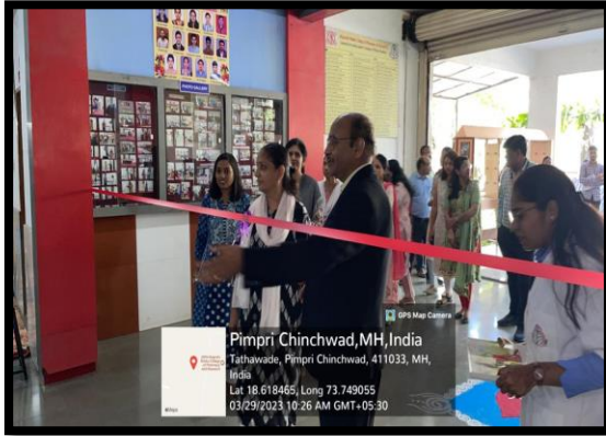
Blood donation camp inauguration