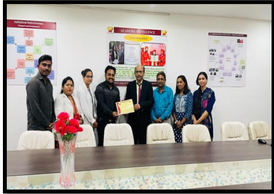
Received certificate From Blood bank