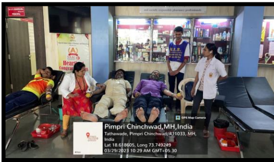
Active participation of staff and students in blood donation